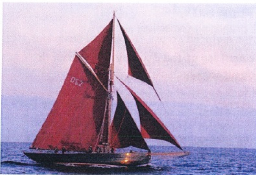
The Jolie Brise

The Jolie Brise was sailing to Great Yarmouth to moor there for the night. We then aboard Moosk decided to join them at Great Yarmouth for an overnight stay and enjoyed an evening barbecue on the beach with the crew off the Jolie Brise.